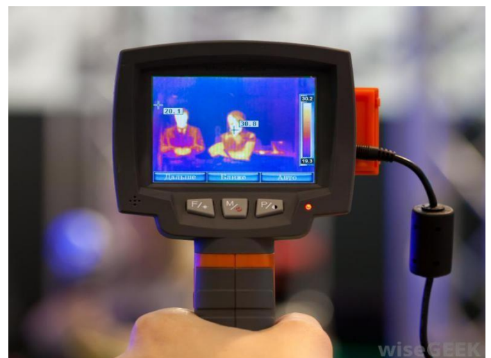
Fig 3: IR Sensor

An infrared sensor is an electronic instrument which is used to sense certain characteristics of its surroundings by either emitting and/or detecting infrared radiation. Infrared sensors are also capable of measuring the heat being emitted by an object and detecting motion. We use this to find the distance and location of the child in high accuracy.