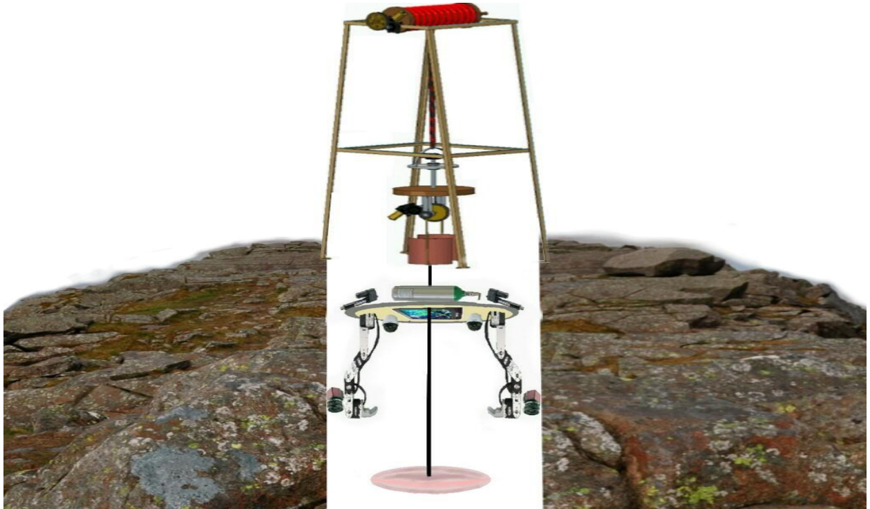
Fig 6: Conceptual Diagram