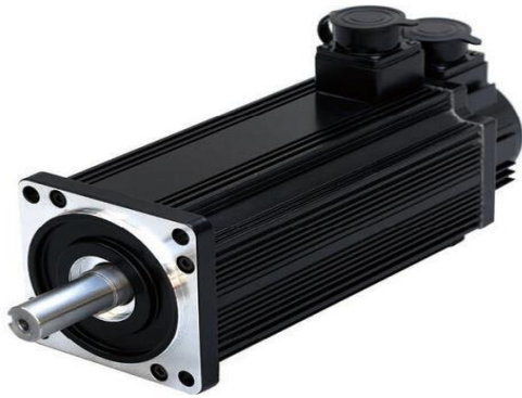
Fig 4: Servo motor

The Servo motors are used to control the movement of robotic arms and the rotation of circular disc to operate the instrument. They could operate at low speed and capable of operating on reasonable work load.