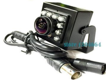
Fig 2: Cctv camera

CCTV (closed-circuit television) is a TV system in which signals are not publicly distributed but are monitored, primarily for surveillance and security purposes. CCTV relies on strategic placement of cameras , and observation of the camera's input on monitors somewhere. We use this to monitor the location of child and also to find the gap between the child and the well.\