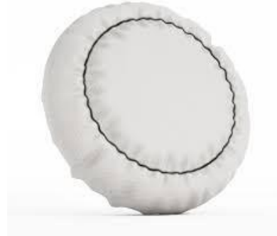
Fig 5: Air bag

cushion, a flexible fabric bag, inflation module. It is inflated under the child to avoid further sliding into the hole. Also it provides a basement for the child to pull up.