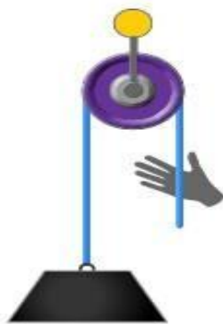
Fig 1: Pulley

Pulley systems are used to provide us with a mechanical advantage, where the amount of input effort is multiplied to exert greater forces on a load. We use this to push and pull or lift the entire system and child in rescue operation.