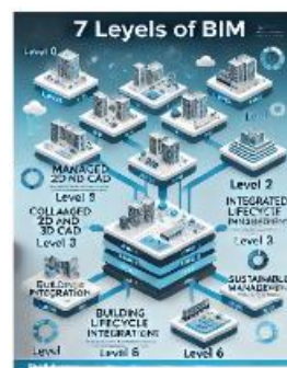
Figure 1. layers of BIM

construction projects that use BIM, as well as in the design, procurement, and construction execution processes, all elements can be easily connected.[5]. To achieve this, a concept is needed that can encompass all aspects of construction, from the planning stage, design, procurement, to implementation in the field.[6]. The main functions of BIM are to isolate and improve the accuracy of the scope of work, facilitate project planning and management, and enable a high level of precision and accuracy in the planning and design of construction projects.[7] The structural elements that are modeled include foundations, main columns, practical columns, beams, primary beams, secondary beams, floor slabs, and roof frames. After the modeling of the structural elements is completed, the detailing process is carried out, which includes the addition of reinforcement and connections, adjusted to the data obtained from the design consultants[8].